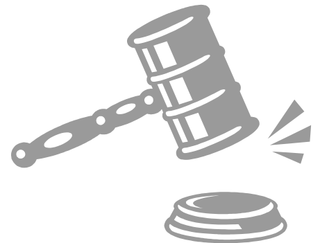
Channel 96 Government Access