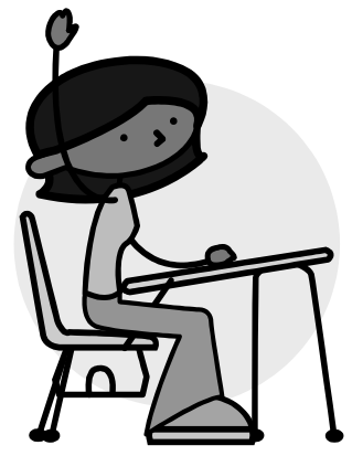
Channel 95 Educational Access