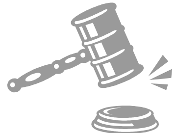
Channel 96 Government Access