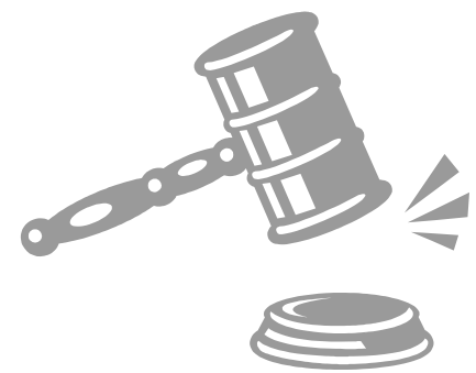
Channel 96 Government Access