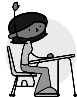
Channel 95 Educational Access